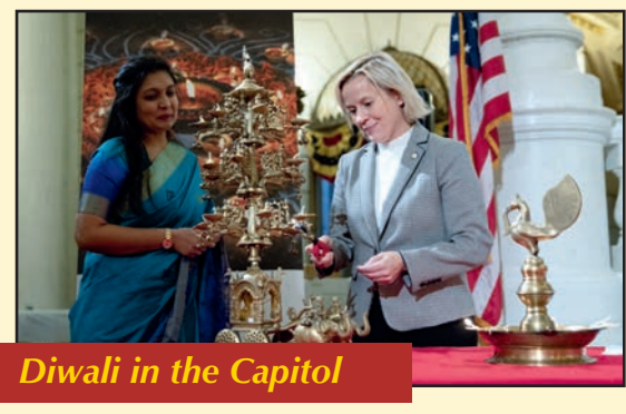
I was excited to celebrate Diwali in the Capitol with members of the Hindu community from District 12 and across Pennsylvania.