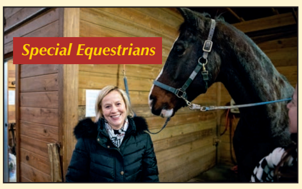
I had the wonderful opportunity to visit Special Equestrians in Warrington Township, a therapeutic horse riding program for individuals with disabilities, addictions and trauma.

This fall, Gwynedd Mercy University celebrated the completion of their Loop Road project, which will serve to make the campus safer and more pedestrianfriendly. I'm proud to partner with state and local officials to support the school's progress!