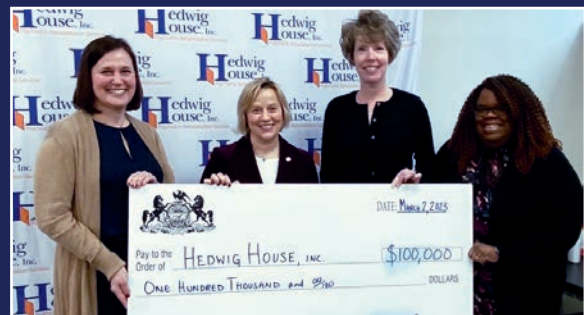
Hedwig House's "Healthier You"