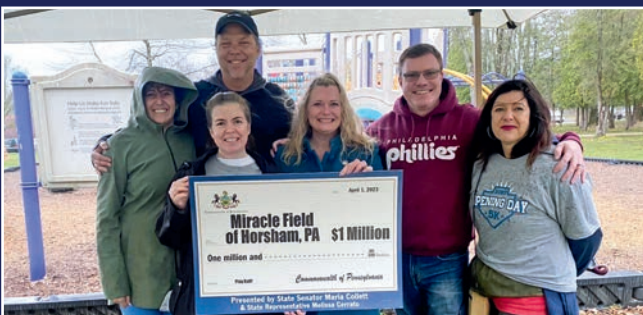
Miracle Field Baseball Field