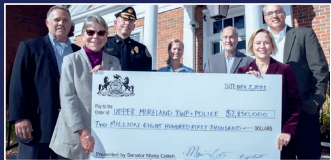
Upper Moreland Township Building