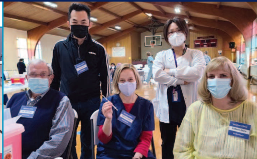
Jaisohn Medical Center Clinic at St Maria Goretti