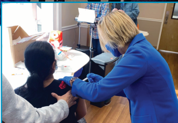
Sellersville Pharmacy Clinic at My Dayhouse Achievement Center in Chalfont