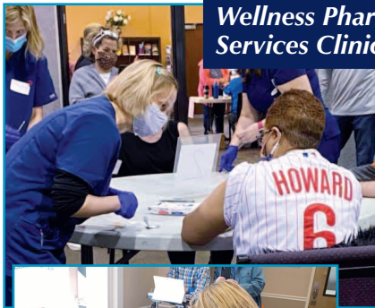
Wellness Pharmacy Services Clinic in Dresher