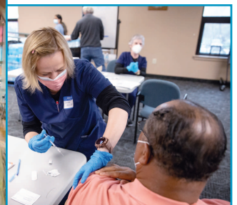
Eric's RX Shoppe Clinic in Upper Dublin Township