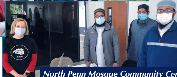
North Penn Mosque Community Center Clinic